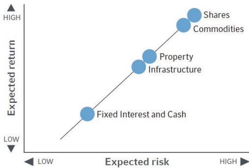
Position on risk/return spectrum